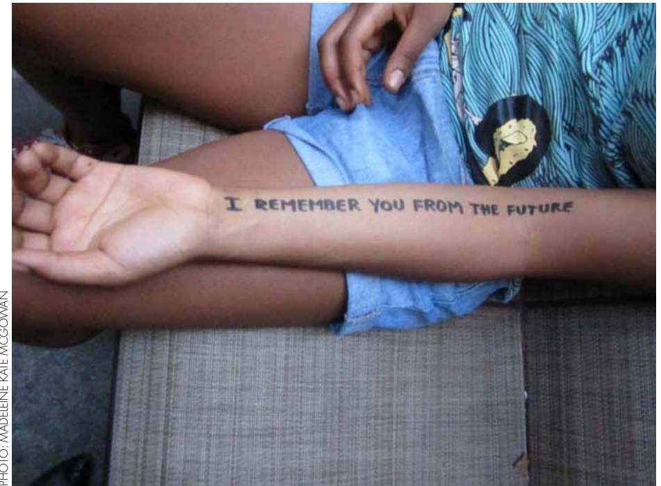
FROM "TIME AND SPACE DIED YESTERDAY", NEW YORK 2010